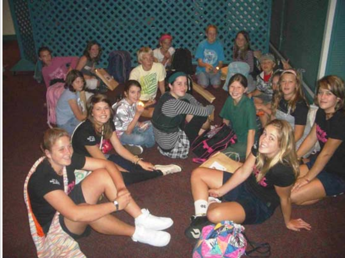
Northern Beaches Students attending the GLC