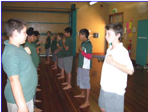
5/6R displaying the Rock & Water salute