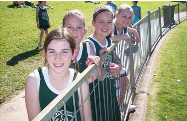
Pictured above are some of our wonderful athletes who represented WPS at the District Athletics Carnival last week.

Last Thursday, 31 July, was a magnificent day for a District Athletics Carnival and WPS had almost fifty athletes representing our school at the Coffs Harbour International Stadium!!