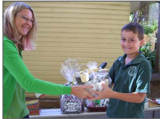
Mother's Day Activities were a huge success

The process of shopping also assisted the children to practice decision making, budgeting, addition and subtraction. No doubt their skills were also tested in the transportation of purchases!