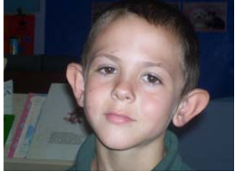
... play on the computers By Ty