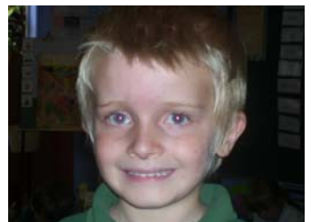
... play with the train set By Jamie