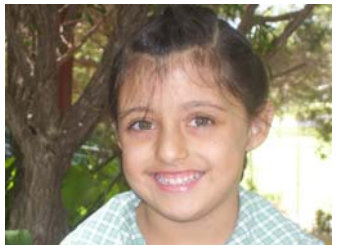
... play on the computers By Shivani