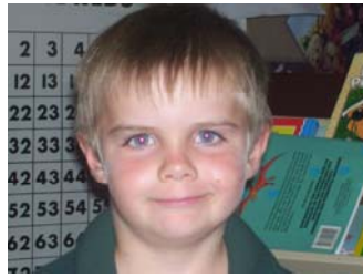
... play on the oval By Brady