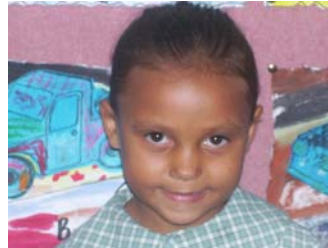
... learn about all different things By Hayley