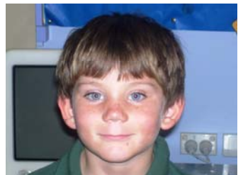
... go on the computers By Travys