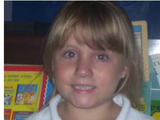
... practice writing my numbers on the white board By Paige