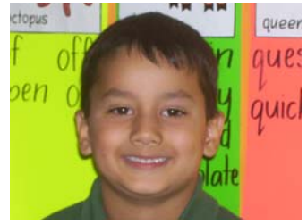
... play on the oval By Yuvraj