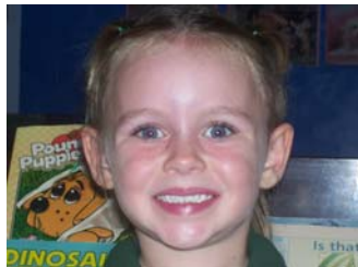
... go on the computers By Talisha