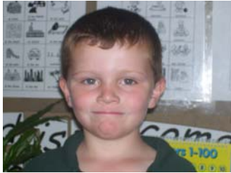
... play with toys under the Kindy COLA By Kobey